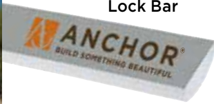
Landmark Lock Bar

See anchorwall.com for installation instructions.